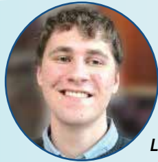
by Mark Levengood